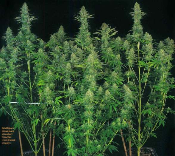
Bubblegum grows many secondary branches when trained properly.

"She may not be the most easy-to-grow plant, but she can be the most rewarding if cultivated the right way."